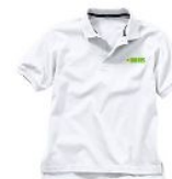
8. Short Sleeve Solid Mesh Polo Shirt