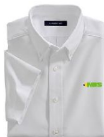
1. Boys' Short Sleeve Oxford Shirt