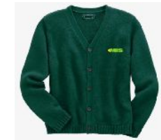
4. Button-front Drifter Cardigan

Style# 231116 / Little Girls / 4 5 6 6X Style# 231118 / Girls / 7 8 10 12 14 16