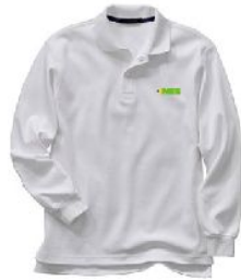
1. Long Sleeve Solid Performance Interlock Polo Shirt