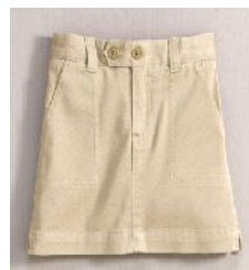
2. Girls' Two-button Stretch Chino Skort

Style# 219321 / Little Girls / 4 5 6 6X Style# 219322 / Girls / 7 8 10 12 14 16