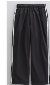
9. Athletic Pants