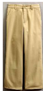
2. Plain Front Blended Chino Pants

S# 230957 / Little Girls/ S M L S# 230958 / Girls / S M L XL