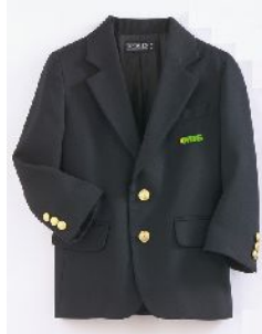
1. Hopsack Blazer