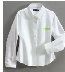
2. Long Sleeve Oxford Shirt

Style# 219457 / Little Girls / 4 5 6 6X Style# 219458 / Girls / 7 8 10 12 14 16