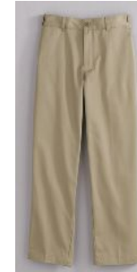
3. Plain Front Blended Chino Pants

Style# 219315 / Little Boys / 4 5 6 7 Style# 219308 / Boys / 8 10 12 14 16 18 20