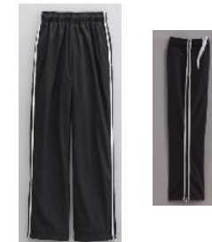
7. Athletic Pants

Style# 051467 / Little kids / S M L Style# 051469 / kids / S M L XL