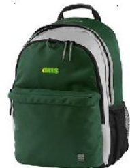
6. Solid Classmate Backpack