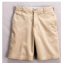
2. Boys' Plain Front Stain & Wrinkle Resistant Chino Shorts

Style# 219302 / Little Boys / 4 5 6 7 Style# 219304 / Boys / 8 10 12 14 16 18 20