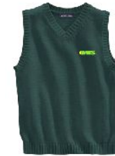
4. Drifter Sweater Vest

Style# 191125 / Little Boys / 4 5 6 7 Style# 191127 / Boys / 8 10 12 14 16 18 20