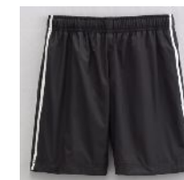
3. Girls' Athletic Shorts