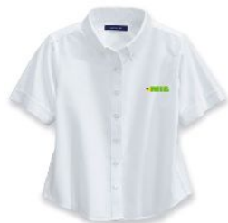
1. Girls' Short Sleeve Oxford Shirt