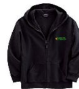
7. Zip-front Hooded Jacket