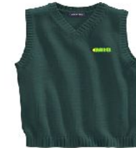
3. Drifter Sweater Vest

* We hem only for Style# 191127 (size 8 to 20) free of charge. If you do not specify a hemming length, your pants will be delivered unfinished.