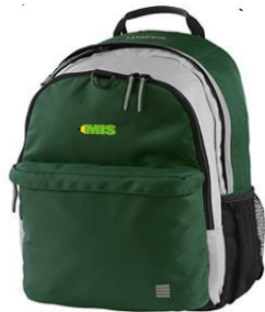
4. Solid Classmate Junior Backpack

Style# 223014 / Little kids/ S M L Style# 223015 / Kids / S M L XL