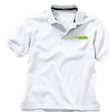
6. Short Sleeve Solid Mesh Polo Shirt

Style# 252116 / Little kids / S M L Style# 252117 / kids / S M L XL