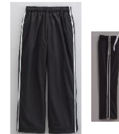
9. Athletic Pants