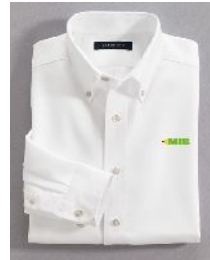
2. Long Sleeve Oxford Shirt

Style# 090368 / Little Boys / 4 5 6 7 Style# 090369 / Boys / 8 10 12 14 16 18 20