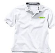
6. Short Sleeve Solid Mesh Polo Shirt

Style# 252116 / Little kids / S M L Style# 252117 / kids / S M L XL