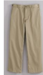
2. Plain Front Blended Chino Pants

S# 051356 / Little Kids / S M L S# 051369 / Kids / S M L XL