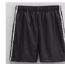
3. Boys' Athletic Shorts