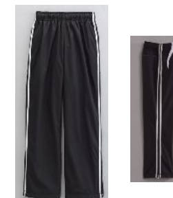
7. Athletic Pants

Style# 051467 / Little kids / S M L Style# 051469 / kids / S M L XL