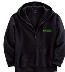
5. Zip-front Hooded Jacket