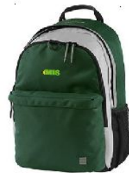
6. Solid Classmate Backpack