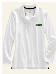
1. Long Sleeve Feminine Fit Interlock Polo Shirt