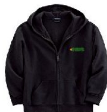
5. Zip-front Hooded Jacket