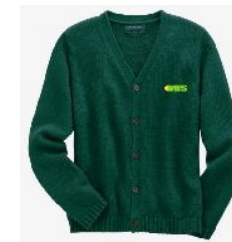
3. Button-front Drifter Cardigan

* We hem only for Style# 231118 (size 7 to 16) free of charge. If you do not specify a hemming length, your pants will be delivered unfinished.